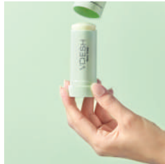
COMPACT, PORTABLE DESIGN

ENHANCE YOUR FOOT CARE ROUTINE & PAIR WITH: