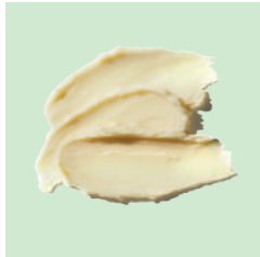
RICH, MOISTURIZING FORMULA